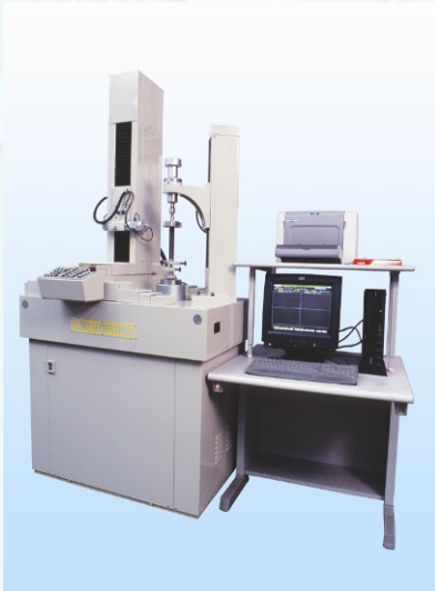
Gear Measuring Instrument